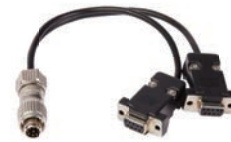
PLC Cable ASG-SDC1500-DT