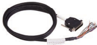
I/O Cable ASG-SDC1500-IO