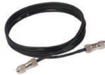
Controller Cable ASG-SDC1500-PC