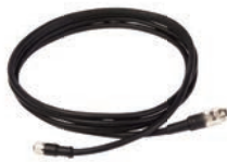
Tool Cable ASG-SDC1500-TC