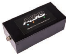
Power Supply ASG-SDC1500-PS